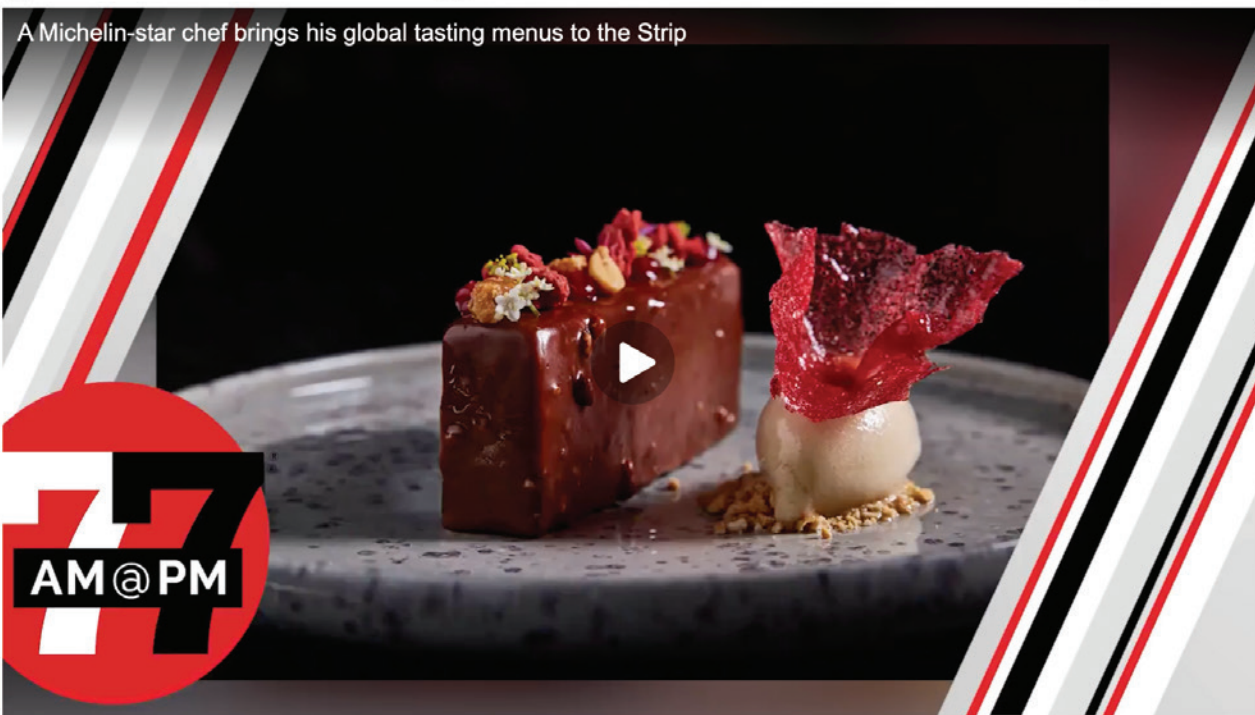
A James Beard Award semifinalist and "Top Chef" season 13 winner will open a Las Vegas outpost of Stubborn Seed, his Michelin-starred restaurant out of Miami Beach, on Feb. 10 at Resorts World.

A Michelin-star chef brings his global tasting menus to the Strip