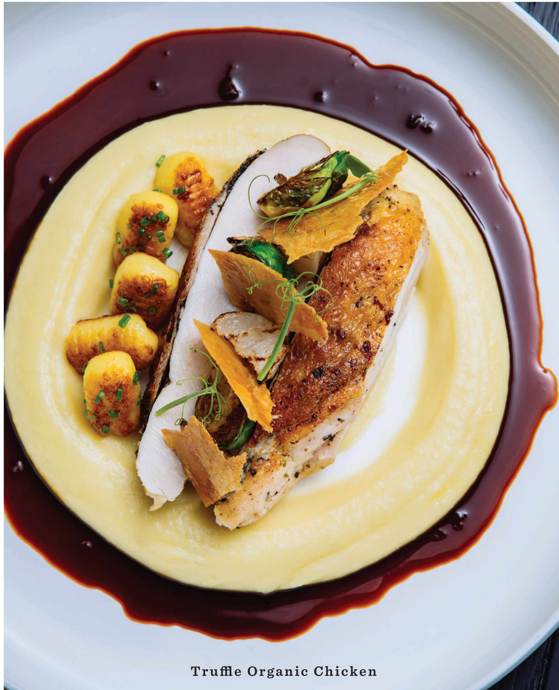
Truffle Organic Chicken

Menus are pre-selected by the host. Guests receive everything listed.