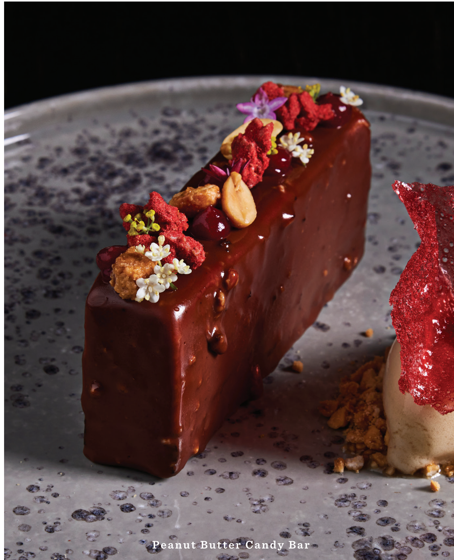
Peanut Butter Candy Bar

Menus are pre-selected by the host. Guests receive everything listed.