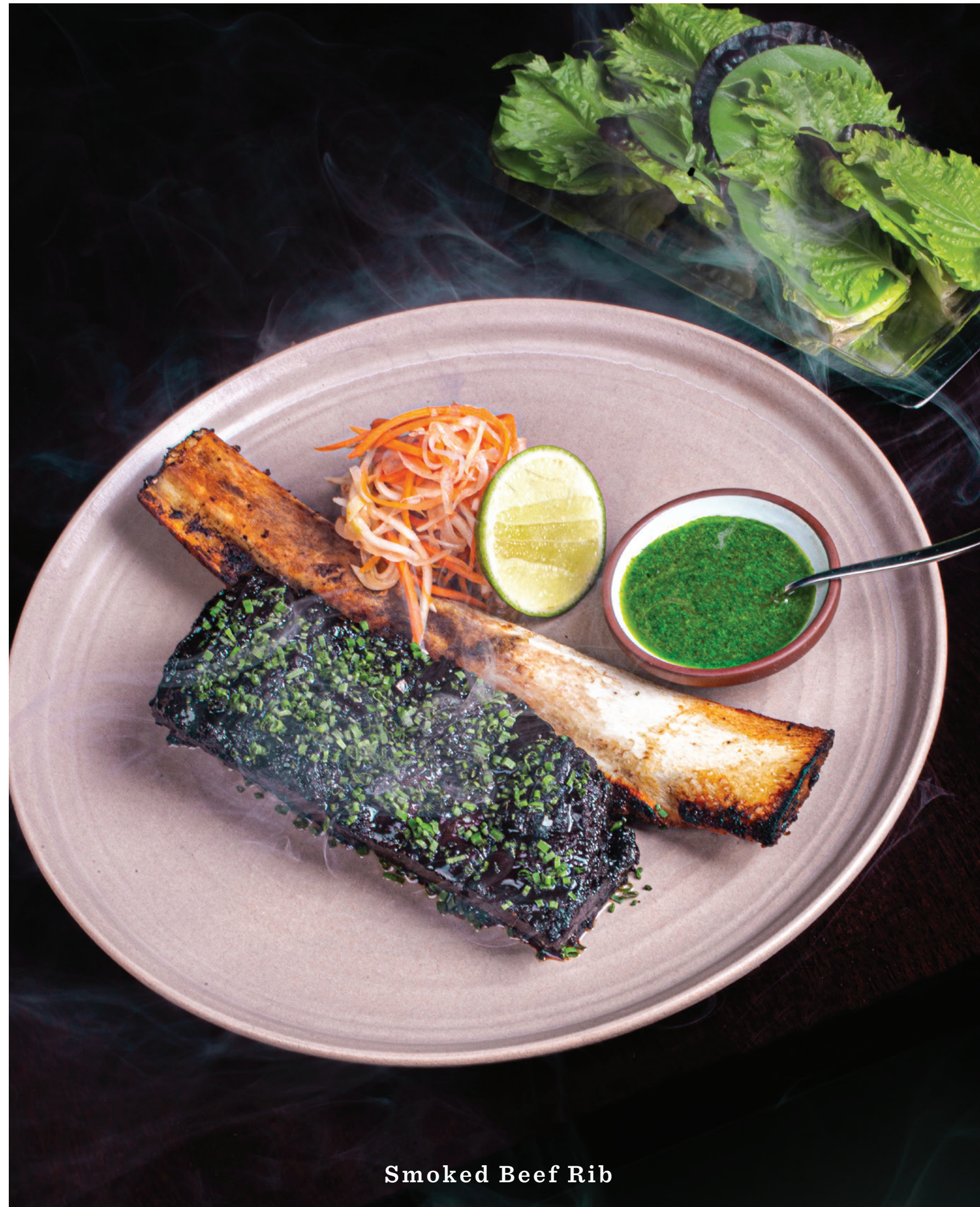
Smoked Beef Rib

Menus are pre-selected by the host. Guests receive everything listed.